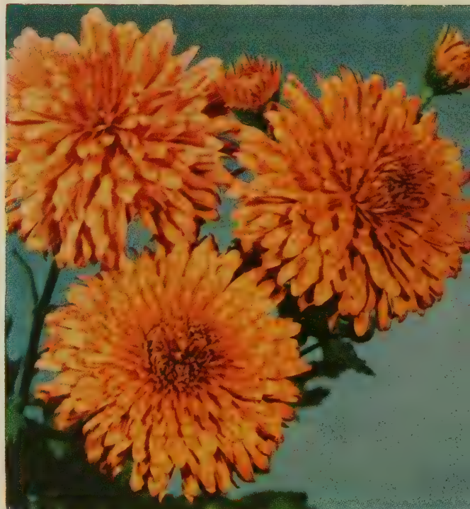
KATHLEEN LEHMAN. 60c each; 3 for $1.50